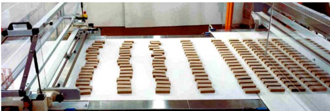
The strongly recommended infeed conveyor of the storage unit complete with row aligner

SACMI Packaging & Chocolate offers fan buffers to increase the efficiency of the existing lines with a storage unit composed of up to 5 conveyors.