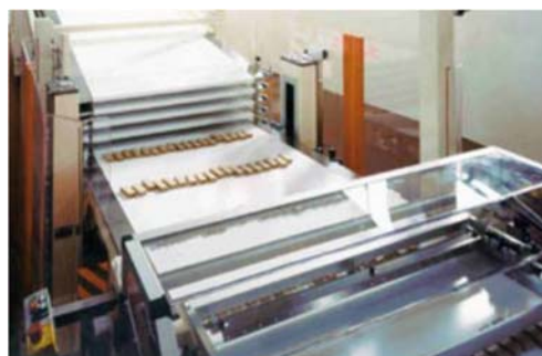
SACMI Packaging & Chocolate can integrate a vast choice of AGVs for different kind of application

The simplicity of the system makes the solution excellent even for integration on existing lines with a minimum number of modifications and on-site work.