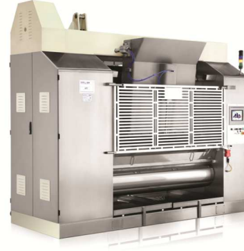
HFI 518 stainless steel