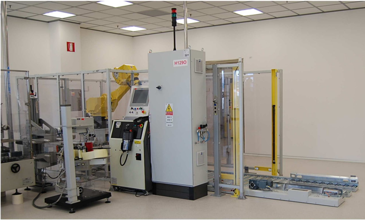
Example of compact palletizer cell installation in a pharmaceutical plant