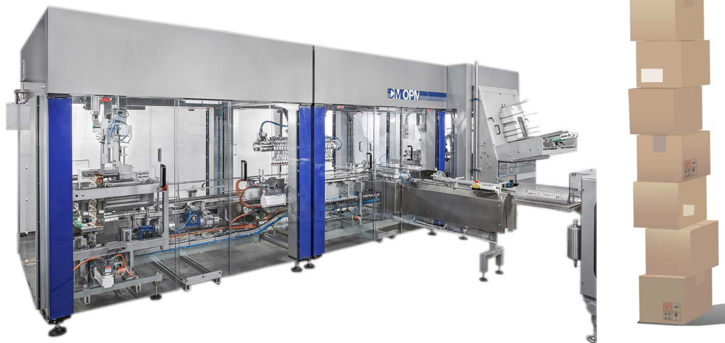
a tri-functional cell configuration

Forms, loads and closes cartons and trays