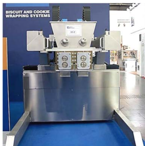
MLR ROTARY DEPOSITOR