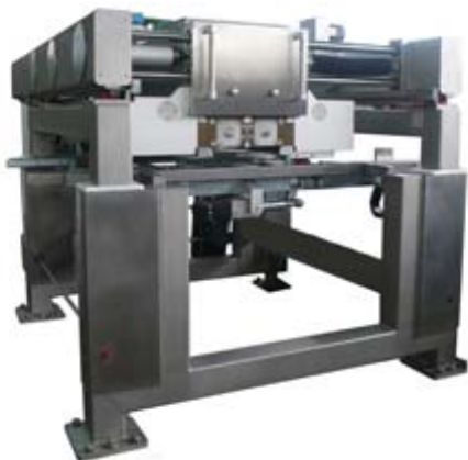
MLP PISTON DEPOSITOR

Piston and rotary depositors conceived for the accurate dosing of chocolate and cream into the moulds.